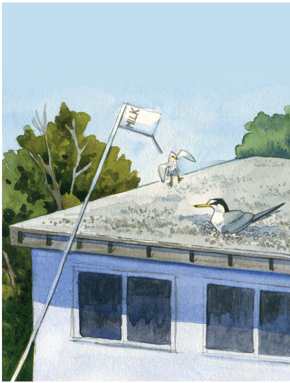
A chick-a-boom returns a chick to a rooftop.

Trash in rivers far inland as well as on beaches can eventually end up in the ocean. Removing trash from creeks, riverbanks, and beaches protects the habitat for seabirds, other wildlife, and people, too.